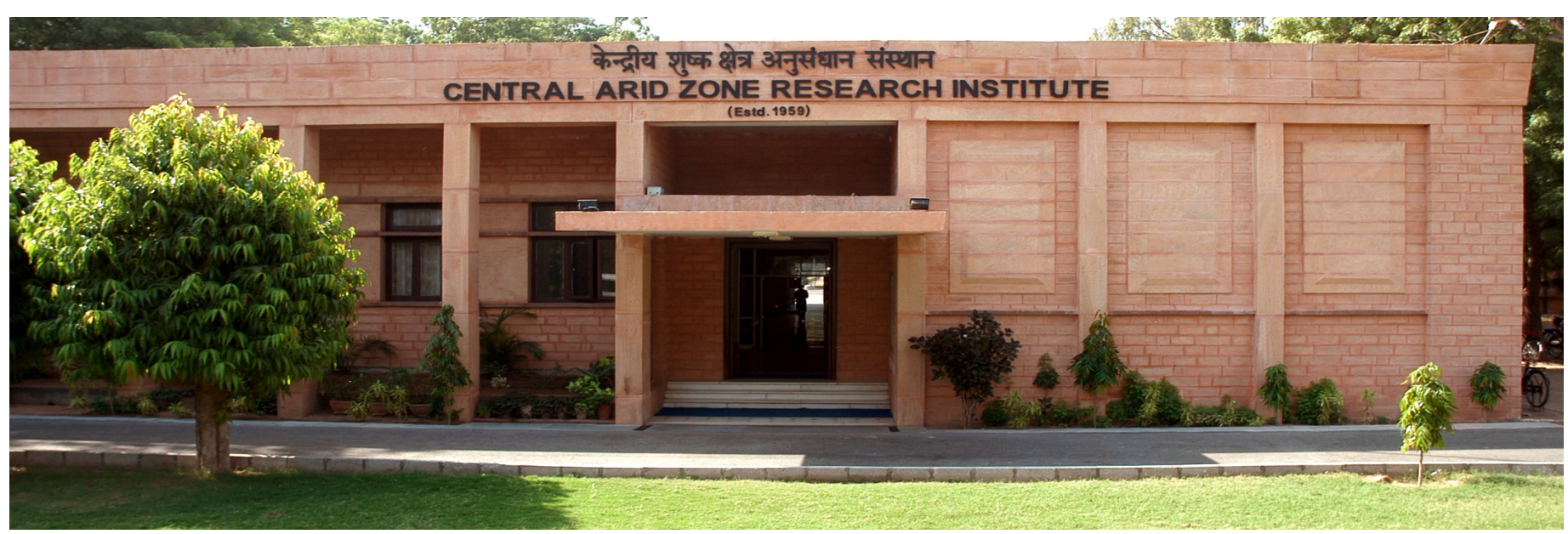
Fig 1. ICAR-Central Arid Zone Research Institute, Jodhpur, Rajasthan