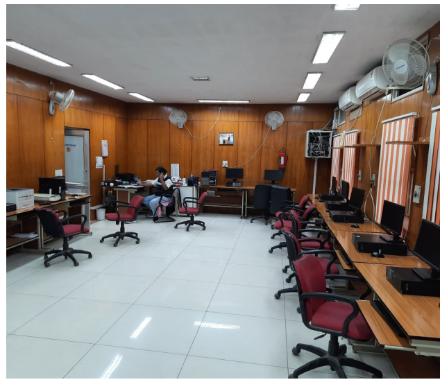
Fig. 7: Agricultural knowledge management unit (AKMU)