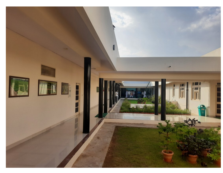
Fig. 3: International guest house (inside