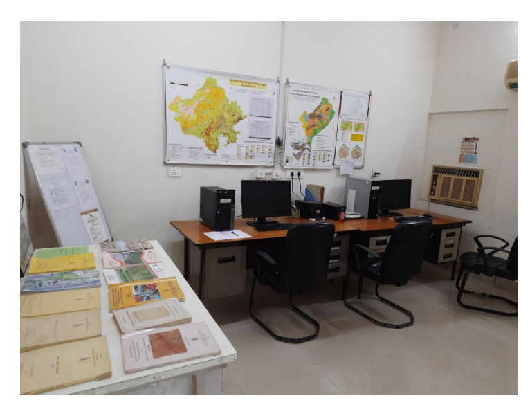
Fig. 5: GIS laboratory