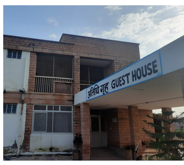
Fig. 4: Guest house