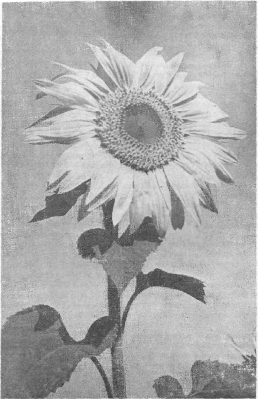
Fig. 1. Sunflower—a promising crop for drylands